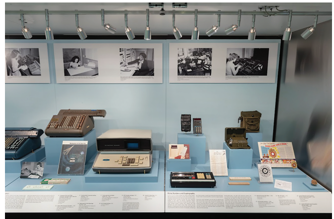
Figure 5. Two uses of the term “computer.”

In choosing objects, we tried to reach both the curious and the indifferent. We wished to include simple objects as well as some mathematically challenging concepts. Ideally, we wanted to show a world of mathematics that stretches the imagination.