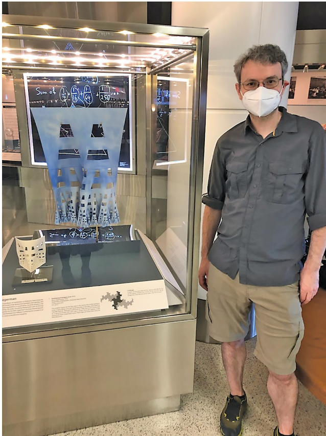
Figure 3. A Sierpiński curve development, with maker Henry Segerman.

must be treated as art objects. No computer displays or videos. Posters were possible, but discouraged. Everything's behind glass for a year, so no motorized mechanisms. Nicole broadened her view of what the exhibit might represent.