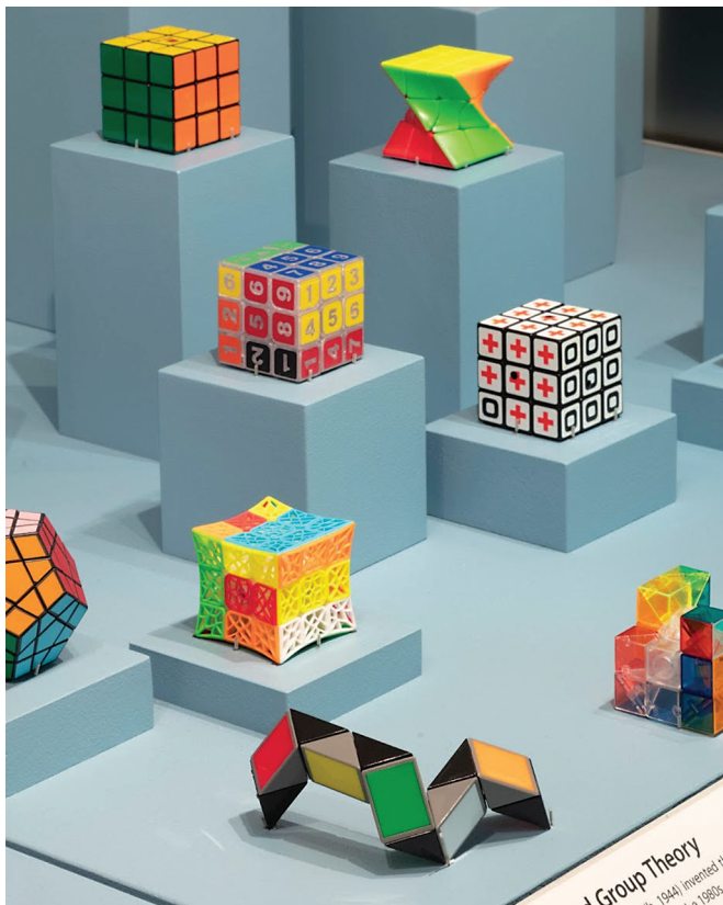
Figure 7. Surprising Rubik's cubes, and friends.

One window is devoted to delicate plaster models that depict cubic polynomials and the Weierstrass p -function. Such models were produced at the end of the 19th century, and collected by many math departments until World War I. They have been the subject of art photos by Man Ray that were exhibited by San Francisco's deYoung Museum not long ago.