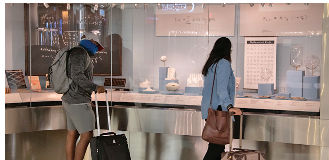
Figure 8. This could be you... and if you can't come in person, these links will show you more: https://www.sfomuseum.org/exhibitions/mathematics-vintage-and-modern , https://photos.app.goo.gl/tpL6AEL2X1YfgtFRA .