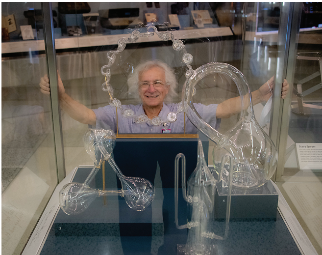
Figure 1. Cliff Stoll, with Klein bottle variations.