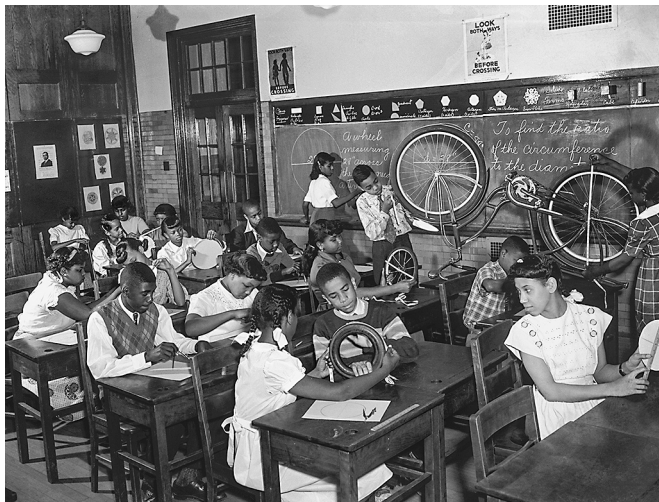
Figure 6. What is the value of \pi ?

Math is taught in every school, so we included numerical toys and manipulatives for elementary arithmetic, together with models from integral calculus—the method of disks and washers. An elegant photo (Fig. 6) shows a class confirming that the ratio of circumference to diameter is the same for (at least) many circular objects.